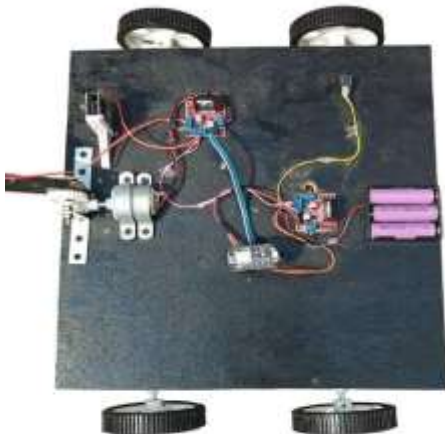
Fig -3: 360 Degree Rotation