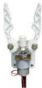
Fig -2: Open grip