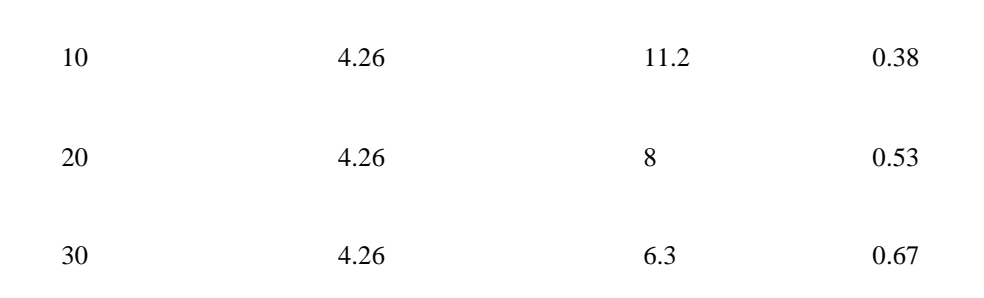
Table 1. Comparison of displacement of all 5 cases

The results and discussion may be combined into a common section or obtainable separately. They may also be broken into subsets with short, revealing captions. An easy way to comply with the conference paper formatting requirements is to use this document as a template and simply type your text into it. This section should be typed in character size 10pt Times New Roman.