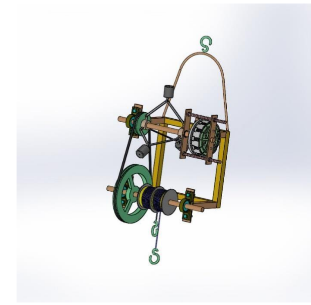
Fig. 1. Parabolic fin CFD analysis