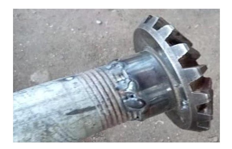
Fig 3: Bevel Gear.