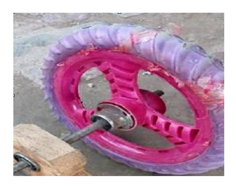
Fig 1: Wheel.

The machine incorporates a cleaning brush, specifically a portable disc brush with inner and outer diameters of 5 inches and 10 inches, respectively (Figure 4(b)). Mounted at the extreme lower portion of the machine and connected to the bevel gears via a chain and sprocket unit, the brush rotates to effectively clean floor surfaces.