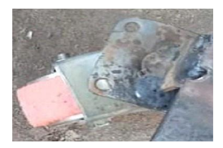
Fig 2: Wheel and Caster Wheel.