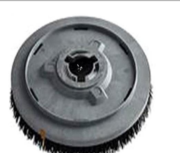
Fig 4: Polite Disc.