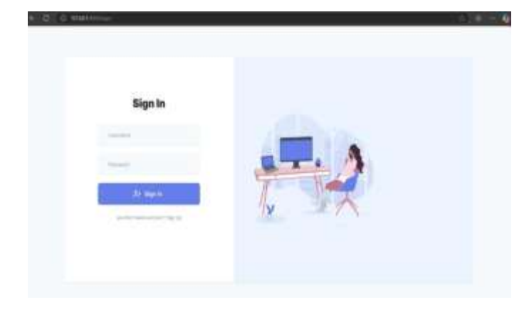
Fig 4.3 - Login Page

The login page (Fig 4.3) serves as the initial entry point for users. It requires users to input their credentials, including a username and password. The page is designed with a clean and intuitive interface to ensure ease of use. The system enforces strong password policies and integrates with identity providers for seamless authentication. This step ensures that only authorized users can proceed to the next stage of verification