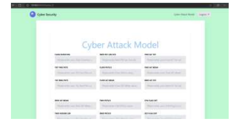
Fig. 4.4 - Dataset Input

The (Fig 4.4), (Fig 4.5) shows a web interface for a "Cyber Attack Model" where users manually input various network traffic features such as flow duration, packet lengths, inter-arrival times, flag counts, packet sizes, subflow bytes, active and idle statistics. This indicates that the model relies on user-provided datasets or values for analysis or prediction, highlighting an interactive system designed for cybersecurity evaluation.