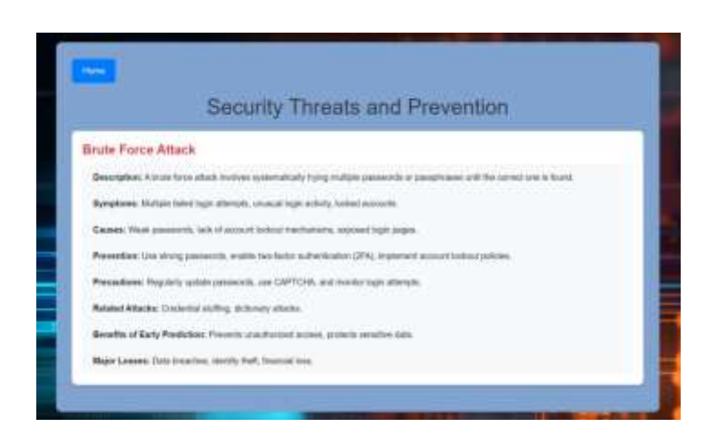
Fig 4.6 - Screenshot of the Result page

The (Fig 4.6) displays the result page of a web application focused on "Security Threats and Prevention". It provides a detailed overview including the attack's description, symptoms, causes, prevention methods, precautions, related threats, benefits of early detection, and major losses. This educational interface aims to raise awareness and guide users on mitigating brute force attacks effectively.