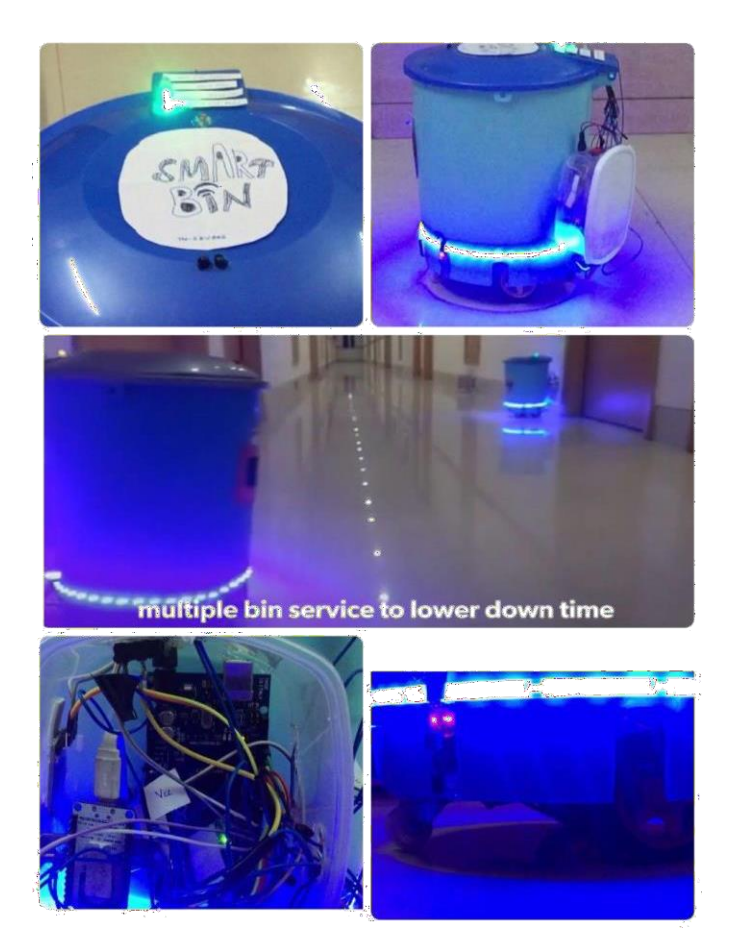
Figure 2: View of Smart Bin from different sides.

In this efficient era where a man's physical work is reduced to an unimaginable level, Smart Bin also focuses on reducing the effort of the user. When it is needed for the user to dispose any waste, the smart bin comes to him (based on the notification sent to it). This significantly reduces the user's work!