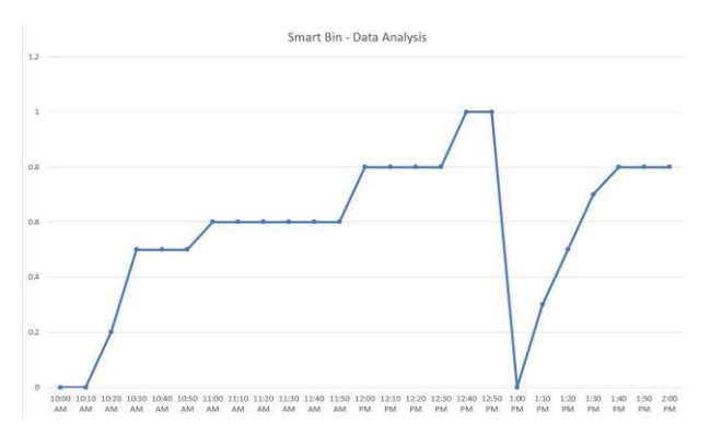
Figure 4: Data collected from the Smart Bin every 10 minutes.

Smart bins have been created keeping smart cities initiatives in mind. The dream of clean and neat environment can be brought out by Smart Bins. Huge amount of focus is given to further the improvement of these bins. Smart Bins can be made smarter by enabling special facial recognition techniques. In the future, smart bins might be able to recognize as well as interact with people. It can also be enabled with the power of memory that can be used to remember a person's name and associate the name withhis/her face.