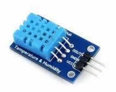
Fig-3 DHT 11 (Temperature and Humidity Sensor)

Using a DHT11 sensor we can detect the temperature and humidity level surrounding environment. GSM sends the notifications to the user about the temperature and humidity level in yield.