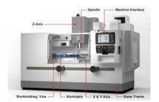
Fig 4: CNC Machine