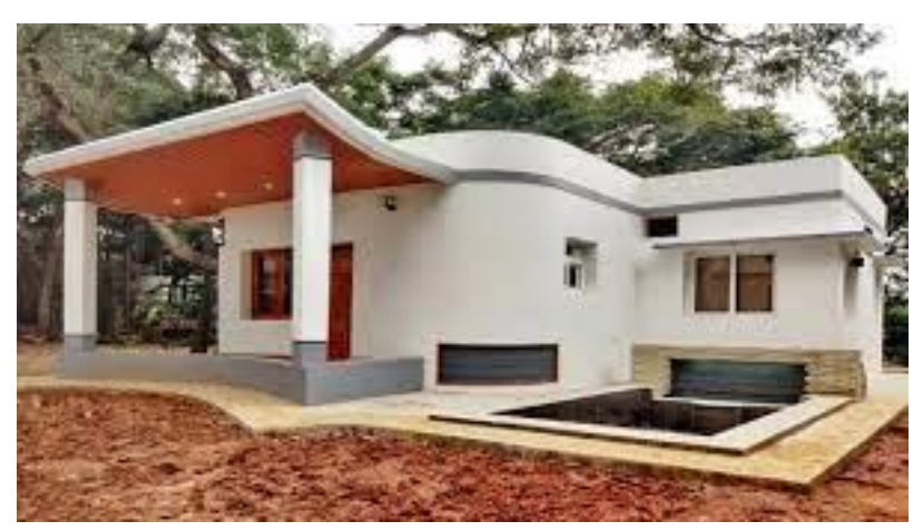
Fig 7: Real Life Image Of The house

Tvasta's first structure is a single-storey house, a 600-sq ft unit, created in collaboration with Habitat for Humanity's Terwilliger Centre for Innovation in Shelter at the IIT-Madras campus. The house was built in just five days. Tvasta's official blog states, "A standard 3D printer can produce a 2,000-sq ft home in less than a week, which is 1/8th of the total time spent today in erecting a functioning house. When it comes to waste materials, this technology creates only 1/3rd of the waste generated using conventional building methods."