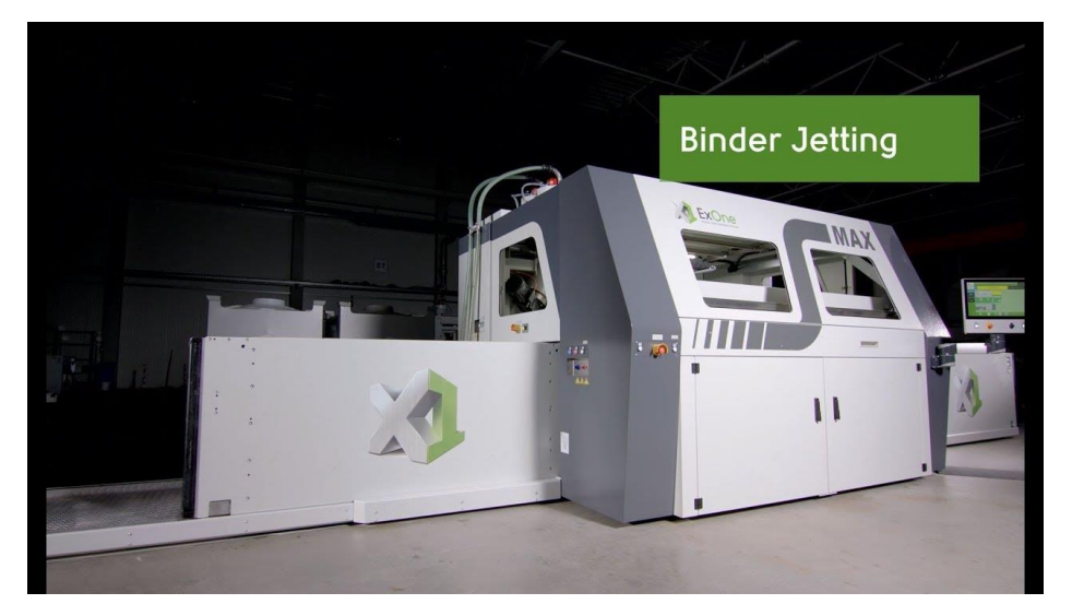
Fig 6: Binder Jetting Machine

One thing to note is that the type of material used should be taken into account when planning the CAD file as the height of a layer can vary according to the material. The most common materials used in this digital fabrication technology are metals, usually alloys like steel, and ceramics.