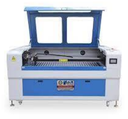
Fig 5: Laser Cutting Machine

Cutting a material is not the only function of a laser cutter; we can also engrave at different depths by adjusting the intensity of the laser and the distance between the nozzle and the material. As it is a relatively easy and fast process, many designers, entrepreneurs and even students can create their own products in large quantities in a short time.