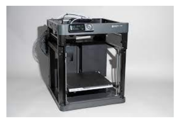
Fig 1: 3D Printer – Machine View

In a typical 3D printing process, lasers, electron beams or thermal heads are used to melt the material. It is then deposited through a nozzle onto the base platform in layers. The object is ready to be taken out once it has been left to dry. Such a method is also known as Material Extrusion.