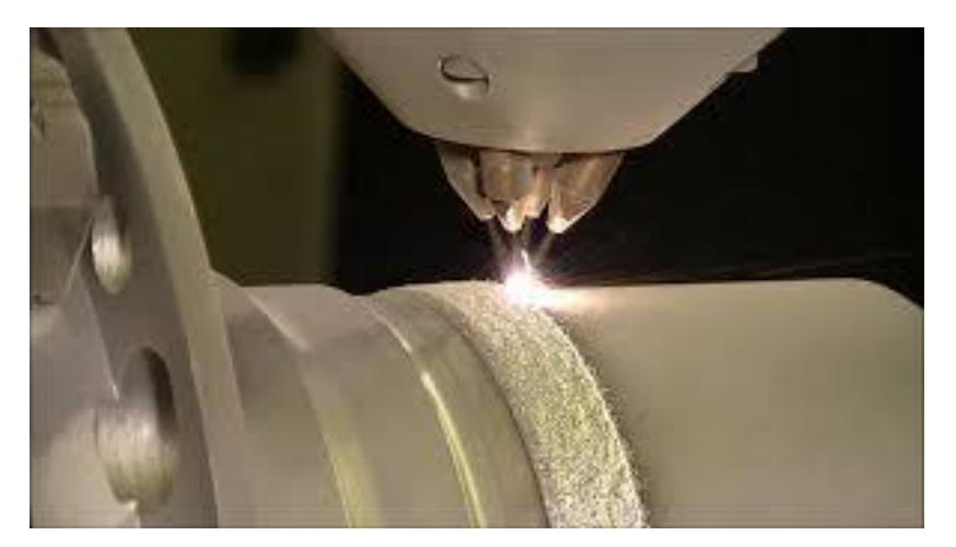
Fig 2: Direct Energy Deposition Machine – Imposing Material