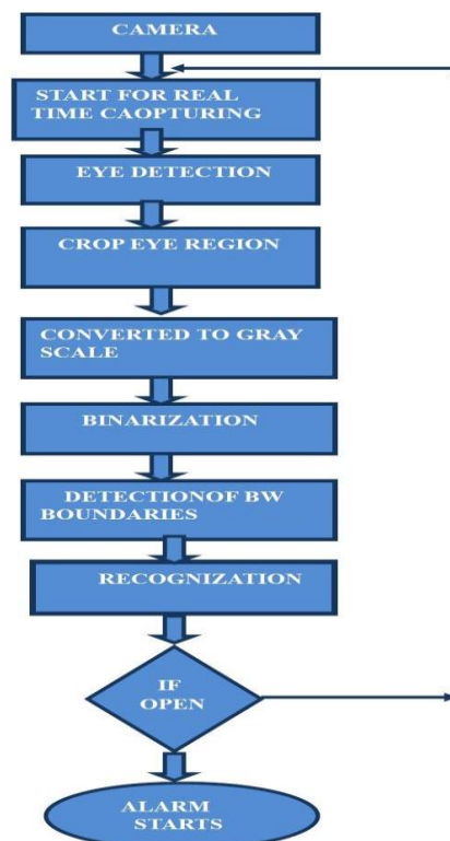
Fig .1.Diagram of the Proposed System

The flowchart of the algorithm is represented in Figure 1