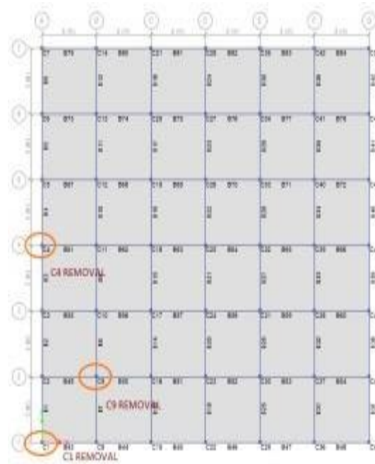
Fig -2: 3D Ready view of G+10 ETABS model with horizontal sections