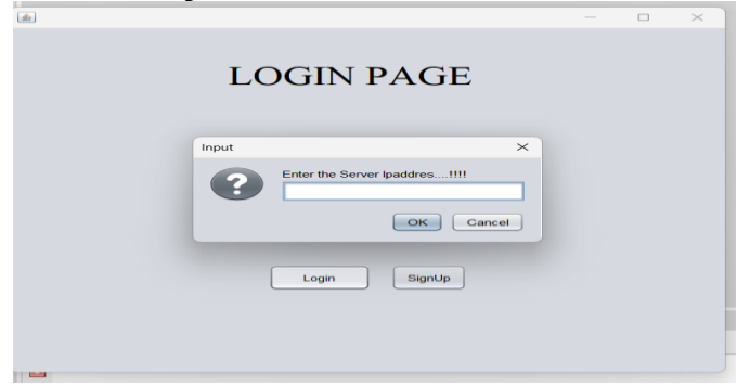
Figure 5: Users Server Ip address While logging, user has to enter Server Ip address for security purpose

In the login page user has to enter his/her username and password to login to the page Users Server Ip address