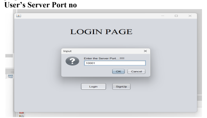
Figure 6: User's Server Port no Enter User Server Port number also before login. Server Status Before User Login

Figure 5: Users Server Ip address While logging, user has to enter Server Ip address for security purpose