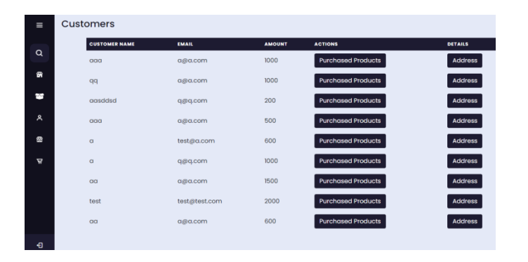
Fig-5: List of Customer's purchased products

Volume: 05 Issue: 12 | Dec - 2021 ISSN: 2582-3930