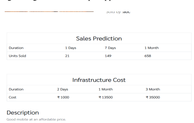
Fig-3: Sales prediction and Infrastructure cost