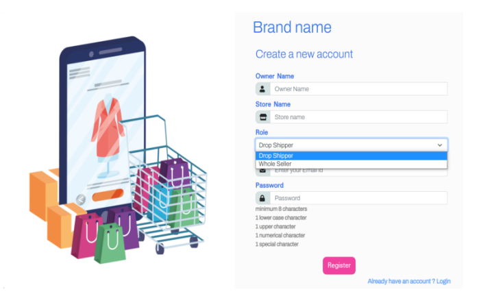
Fig-2: Registration of drop shipper and wholesaler