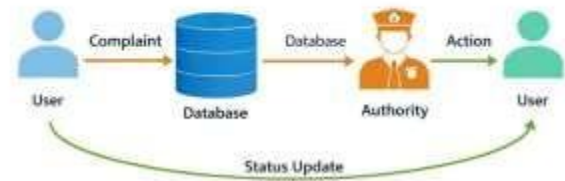
Fig -1: System Workflow Diagram

Fig -1 represents the working process of the E-Gram Seva system. It shows how a complaint moves through different stages from submission to resolution.