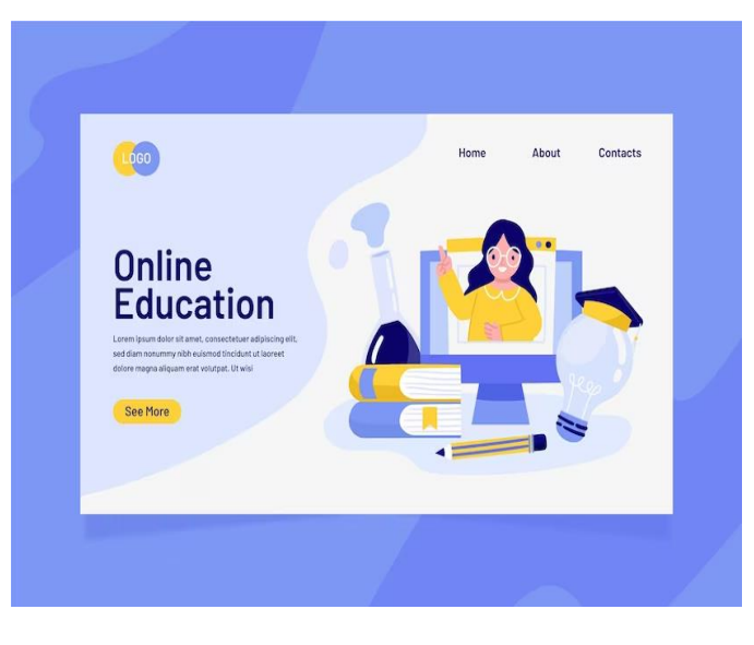
Fig -1: Figure