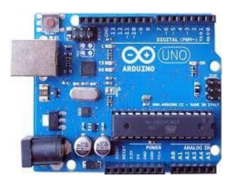
Fig-2: Arduino Uno R3

Clock Speed -16 MHz Length - 68.6 mm Width - 53.4 mm Weight - 25gm