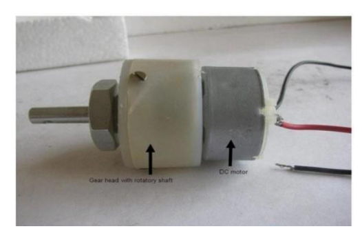
Fig-4: DC motor