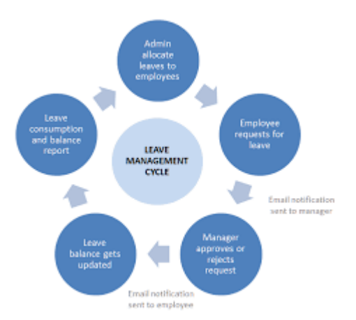
Fig -1: Leave Management System Introduction