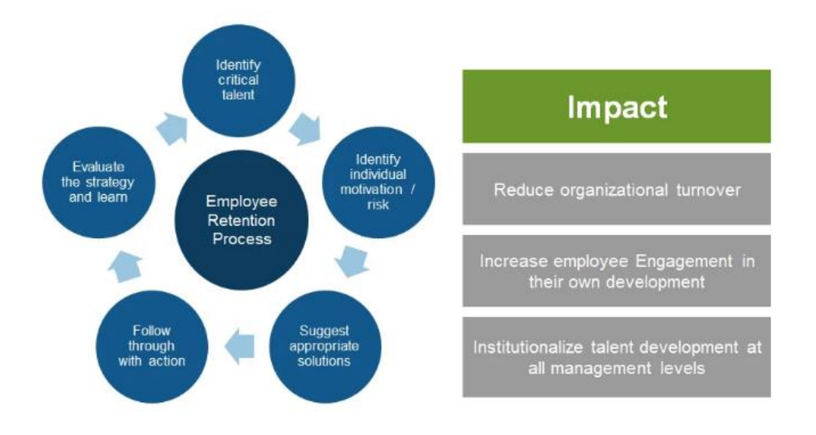
Figure: Effective Employee Retention by "Rodridge J (2007)"

Now coming to the personal life of the employees, employees are looking for alternatives because of their collective desire to improve the balance between work and family.