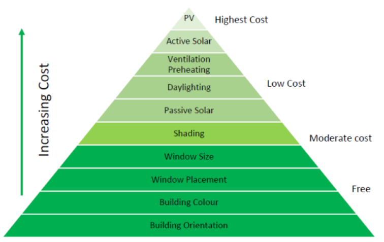
Figure 1. The solar fruit tree chart showing the free and costly strategies Adapted from: Lechner (2014)

Passive design strategies use natural sources of energy to reduce the energy consumed in buildings.