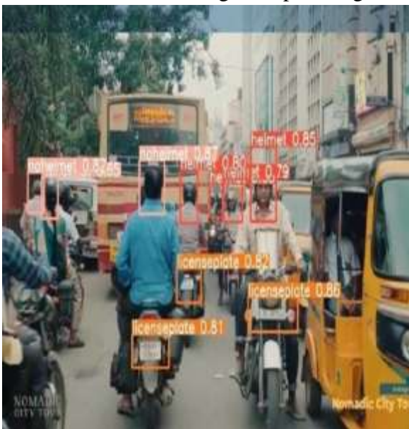
Fig 5 : Proposed model result