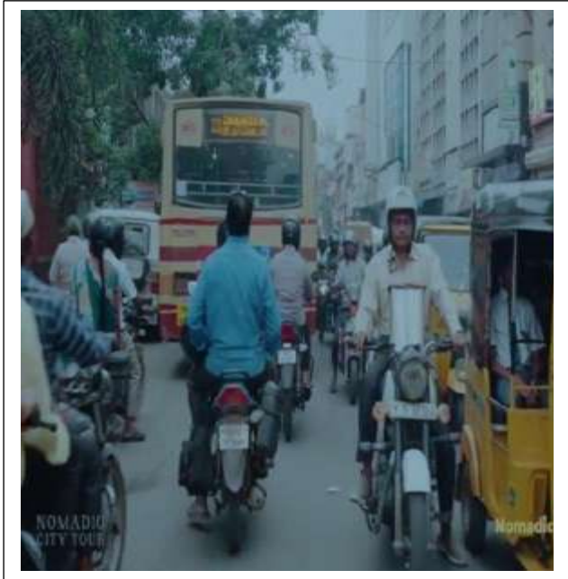
Fig 4 : Input Image