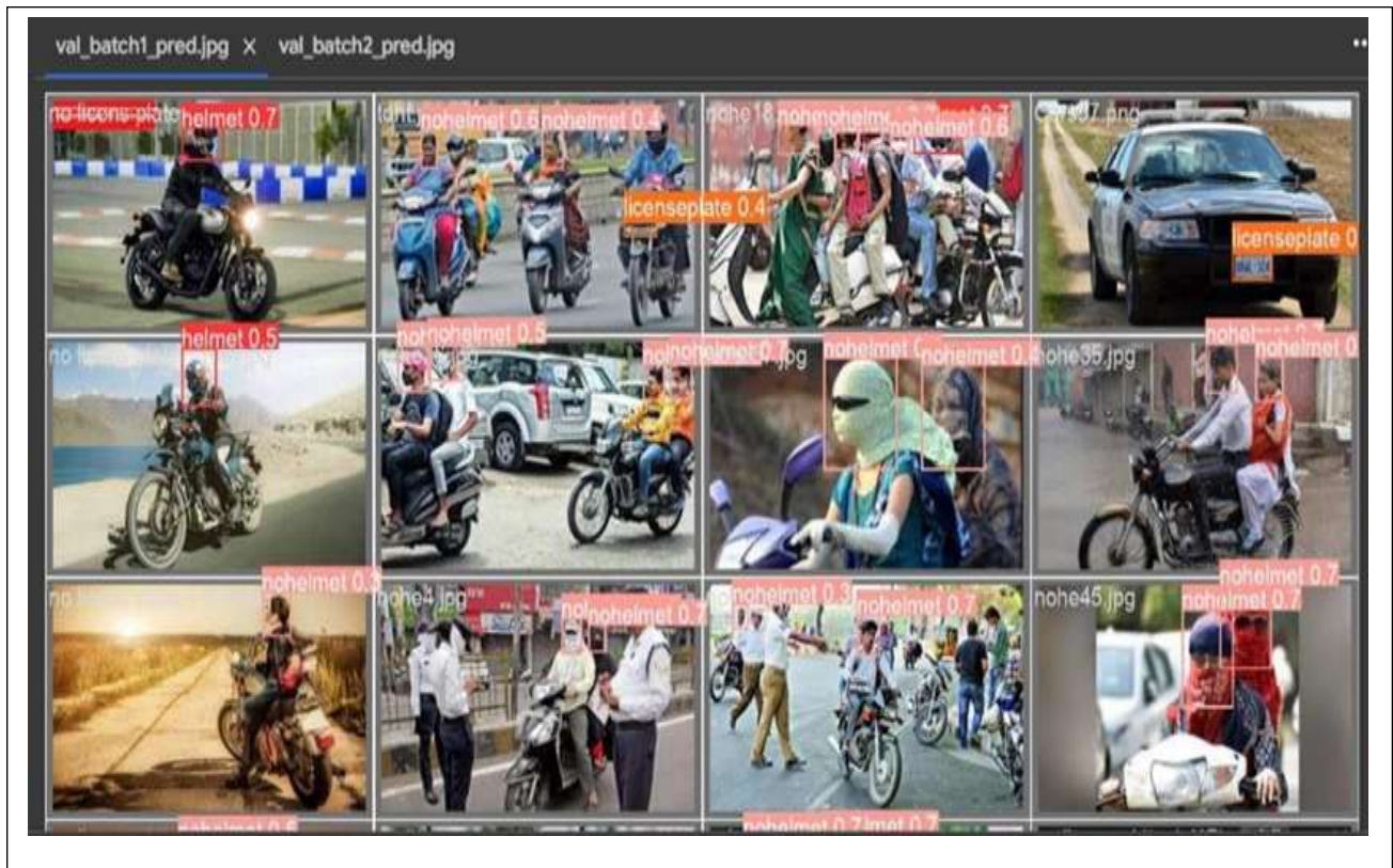
Fig 3: Training outcome