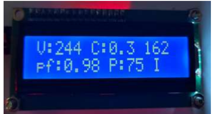
Fig 2: Output for power factor correction

for reactive power and improve the power factor closer to unity.