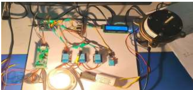
Fig 1: Real time power factor Monitoring

The fig1 represents real time power factor monitoring. This system works by continuously monitoring and controlling electrical parameters using the ESP32 and PZEM-004T. When the power supply is given, the connected loads such as the bulb and motor start operating, which may cause a reduction in power factor due to inductive effects. The PZEM sensor measures important parameters like voltage, current, power, and power factor and sends this data to the ESP32. The controller then processes the data and checks whether the power factor is below the desired level. If the power factor is low, the ESP32 automatically activates relay modules to connect capacitors into the circuit. These capacitors compensate