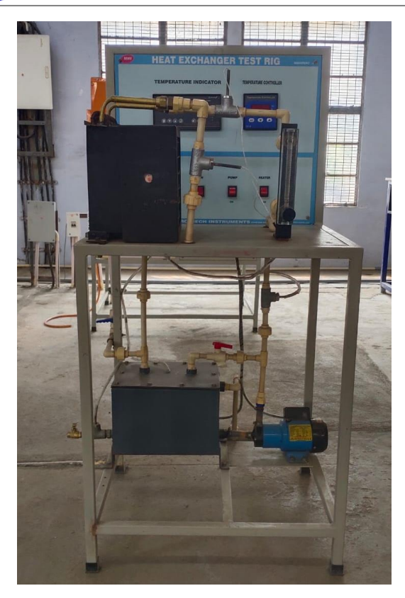
Fig 4.1 Compact Heat Exchanger

In conclusion, the experimental setup described above is designed to investigate the heat transfer enhancement in a compact heat exchanger using nanoparticles as additives in the heat transfer fluid.