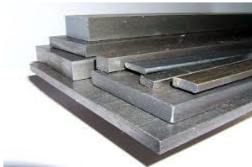
Figure 2. Mild Carbon steel C45 Material