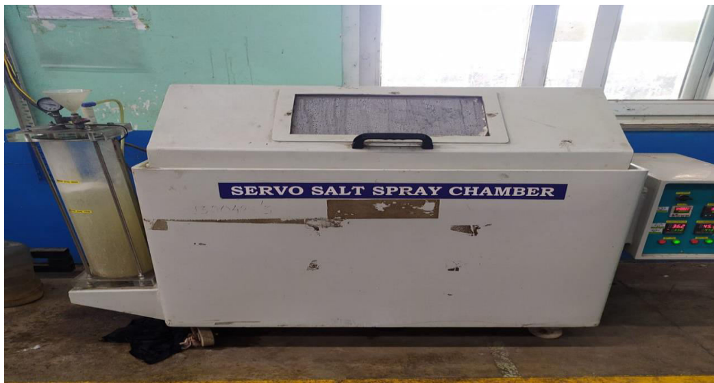
Figure 1. Complete arrangement of experimental setup