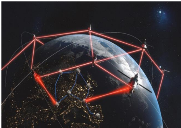
Figure-3: Satellites transmitting data with Laser communication.

As we traditionally used radio frequency waves for space communication, data are extracted at slower rate, in order to puzzle out this problem space agencies introduced optical communication which offers a higher frequency of around 200 terahertz compared to a few gigahertz for radio waves. Laser technology benefits in weight reduction which is crucial for spacecrafts impacting launch costs and mission flexibility. Optical communication helps in reduce power consumption by stemming directly from the physics of light. It mainly focuses on minimize power waste from spreading or absorption and offering greater efficiency. Optical communication is more secure than RF channels as laser beams are precise aiming along a narrow path.