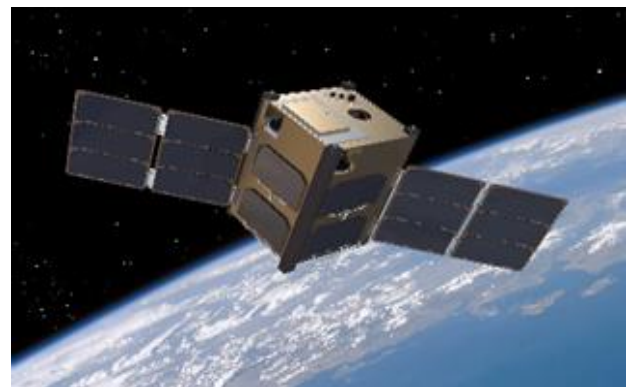
Figure -1: CubeSat with laser technology

the cartridge and release the picosat into earth orbit. The microsatellite fabricated for this purpose was named by Orbiting picosat Automated launchers (OPAL). In the year of 2000, OPAL was successfully launched and DAPRA Picosat performed as planned.