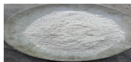
Fig- 1 : Alccofine 1203

One of the newest micro-fine materials, Alccofine 1203, is produced in India and has a particle size that is smaller than that of cement, fly ash, silica fume, etc. Due to its efficient particle size distribution, Alccofine 1203 has special characteristics that can affect the performance of concrete in both its fresh and hardened states. The early strength of concrete made with alccofine 1203 is found to be similar to or greater than that of silica fume. Because alccofine starts the initial chain of events when cement hydrates, this is the reason. Additionally, the alccofine 1203 eats the calcium hydroxide byproduct that is generated during the hydration of cement, increasing the concrete's late-age strength. As a result, it produces additional C-S-H gel that is comparable to that of other pozzolans. Alccofine's calculated particle size distribution PSD) is roughly 12000 cm 2 /g. According to the need, it can be replaced with cement up to a 70% replacement level. Table 5 lists the alccofine 1203's properties.