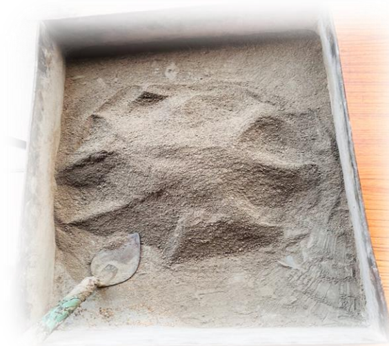
Figure 1: Mixture of the materials

The typical 70.6mm x 70.6mm x70.6mm cubes are cast using a basic hand mould. These were cast using the conventional technique, with different mix proportions arriving. The amount of Silica Fumes, Sand, Cement, and Egg Shell Powder required is estimated based on how well the elements are combined. The needed amount of water was then added. They then completely combined. The produced mix was then squeezed in the mould. The mould is kept at room temperature for 24 hours after compacting. The cube is then removed from the mould. The cubes are stored in curing tanks for seven, fourteen, and twenty-eight days.