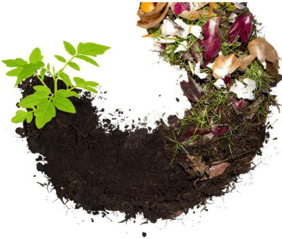
Fig 1. Composting Cycle

brown, granular, humus like end product sometimes described as "loamy". This compost can be used beneficially as a soil conditioner, improving the characteristics of both excessively clayey and sandy soils. Fig 1 shows the cycle of composting.