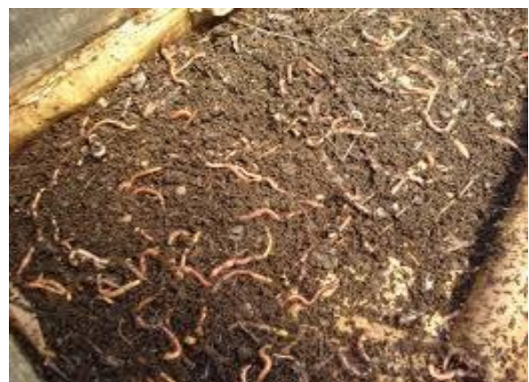
Fig 2. Vermicomposting

Vermicompost tea has been shown to cause a 173.5% increase in plant growth by mass over plants grown without castings. These results were seen with only 10% addition of castings to produce these results.