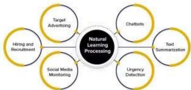
Fig. 2. Use cases of Natural Language Processing in Business Landscape

Inside the sacred walls of academia, NLP is a model of pedagogy, coordinating individualized education and promoting academic success. NLP enables teachers to customize instructional interventions, develop student potential, and promote a culture of lifelong learning by utilizing intelligent tutoring and automated essay grading. This allows educators to break free from conventional pedagogical paradigms and embrace the digital frontier of educational innovation.