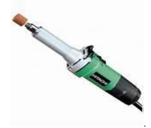
Fig 3.2 Portable grider

On one end of the motor shaft, a grinding wheel is fitted and on the other end, a handle or switch for operating the machine is fixed according to our convenience. It should be used carefully since there is a possibility of getting an electric shock.