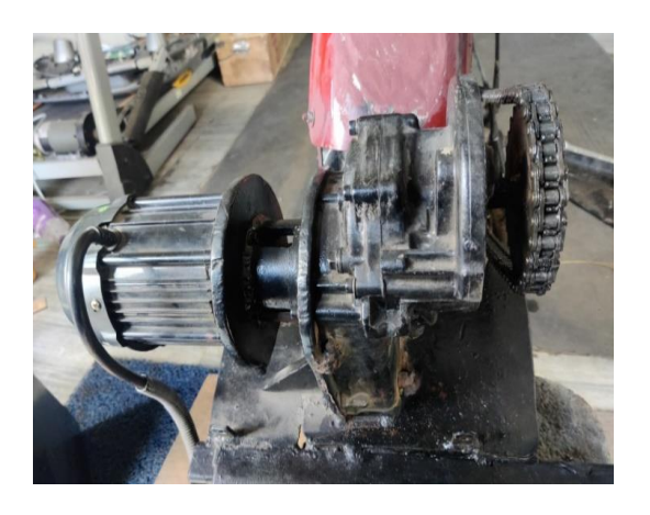
Fig 5.1: Rear wheel motor

Brushless DC electric motor (BLDC motors, BL motors) also known as electronically commutated motors (ECMs, EC motors), or synchronous DC motors, are synchronous motors powered by DC electricity via an inverter or switching power supply which produces an AC electric current to drive each phase of the motor via a closed loop