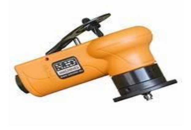
Fig 3.4: beveling machine.

The beveling process is done by using beveling machine which will make the end of the pipe surface inclined.