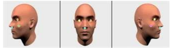
Fig -1: Landmark detection

detection should be done. Each detected landmark includes its associated position within the image