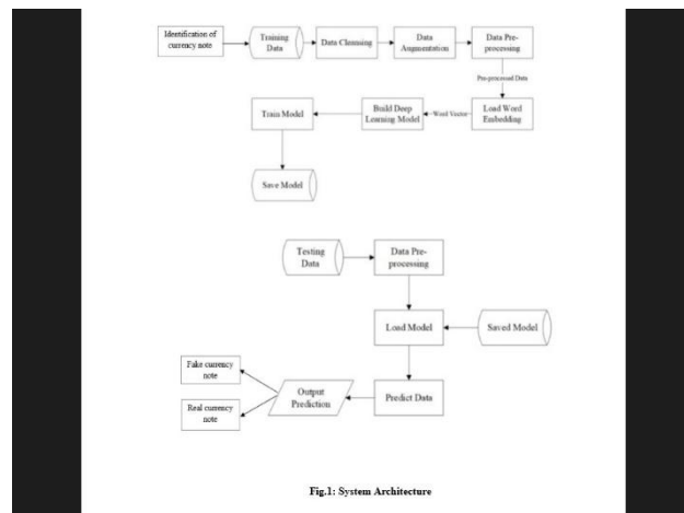
Fig.1: System Architecture