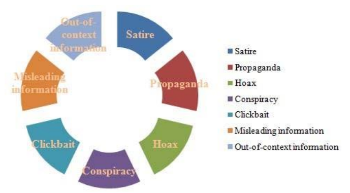
Fig. 1. Different types of Fake News

• Satire, propaganda, hoax, conspiracy, clickbait and misleading or out-of-context information are the different types of fake news shown in the given figure 1.