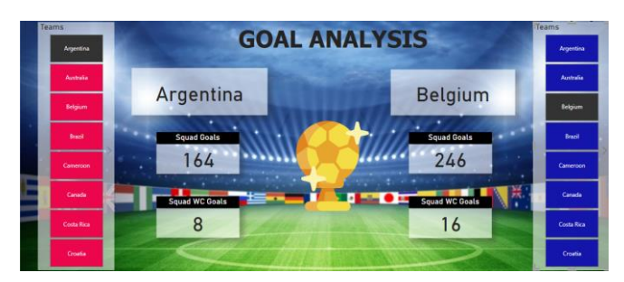
Fig2 – One on One Goal Analysis

As we can see in the Fig1, Argentina team analysis shows us the total world cups played by the team, total world cup wins and wins as a host, FIFA rank, Total world cup goals, Average age of the squad, and also we have two graphs, one showing world cup goals by year and another shows the international goals by year, which are the outcomes of the above mentioned steps.