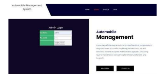
Fig 6: Admin home page