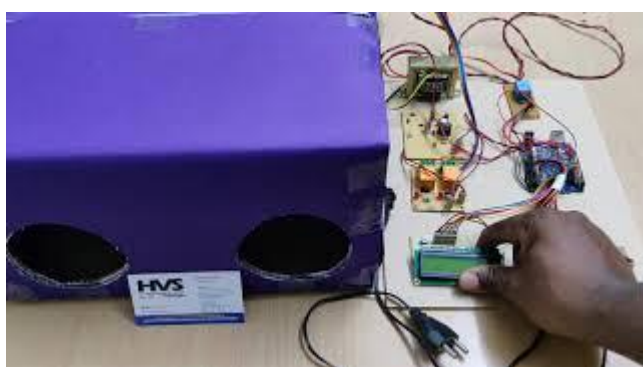
Fig 3: disinfection and UV lighting