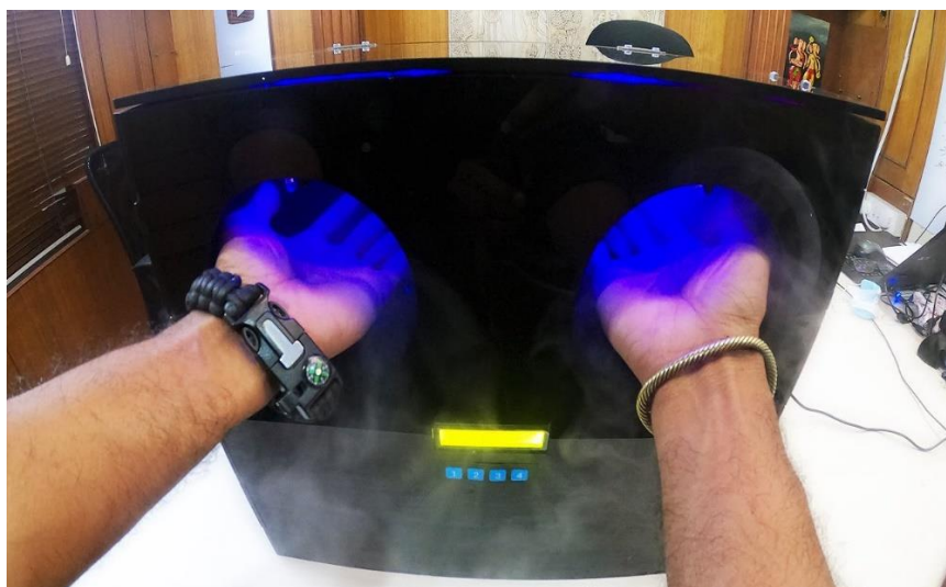
Fig 4: disinfection to save water

implementation of fog-based hand washing systems is expected to contribute positively to hand hygiene practices, water conservation efforts, user satisfaction, and environmental sustainability. However, actual outcomes may vary based on factors such as system design and the specific context of implementation.