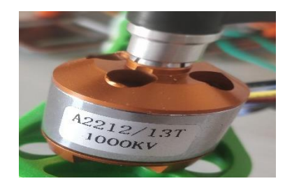
Fig-3: Brushless motor

Brushless motors have significantly higher efficiency and performance, and a lower susceptibility to mechanical wear than their brushed counterparts. There will Each ESC (Electronic Speed Controller) for the brushless motor is a three-phase motor