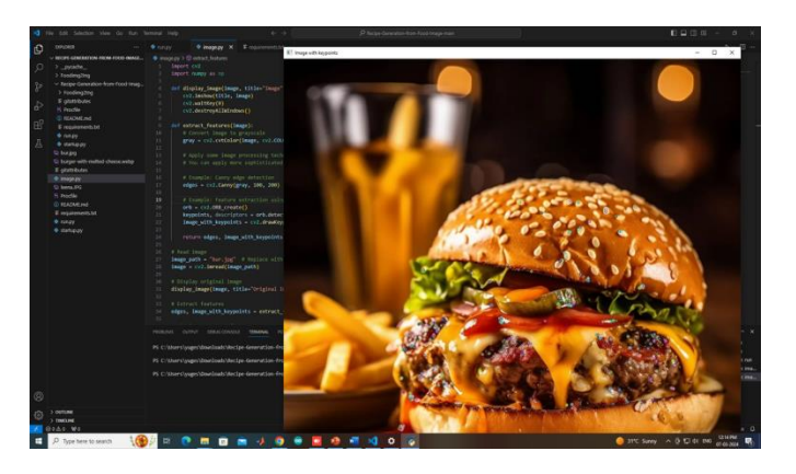
Fig.3 Colour finding from Image