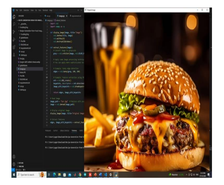
Fig 1:Capturing Image