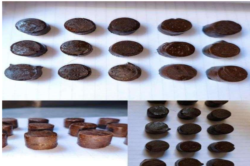
Fig. no. 6 (Hard candy Lozenges)