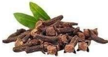
Fig. no. 4

Geographical Source :- Native to Indonesia (Maluku Islands – Spice Islands),