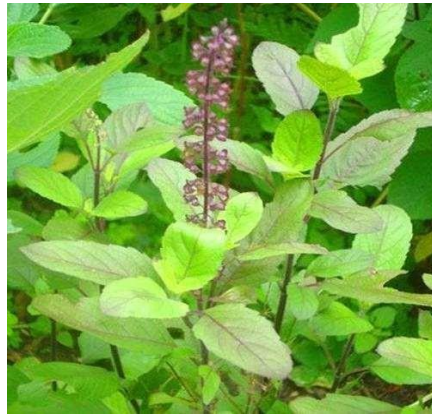
Fig. no. 2

Geographical Source :- India is considered the native and primary source of Ocimum sanctum (Tulsi).