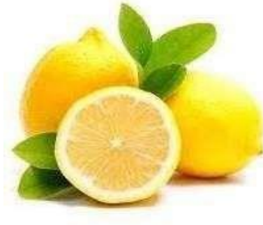
Fig. no. 3 Geographical Source :- Native to northeast India, Myanmar, and China Family :- Rutaceae

Properties:- Astringent, Anti-inflammatory, Antifungal, Antibacterial, Antioxidant