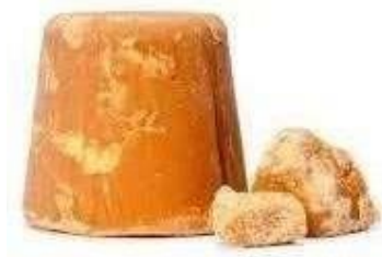
Fig. no. 5

Geographical Source :- Jaggery is widely produced in tropical regions, especially in India, Pakistan.