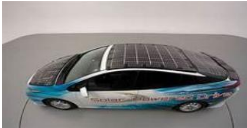
Fig. 1. Solar car

The last one is sound energy it has been seen that there has been a lot of noise pollution. So why not effectively use that sound pollution[4]. By which it can be converted into electrical energy which can be converted. So, it is also one of the forms of producing energy in this future green car.