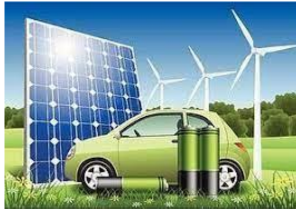
Fig.3.Wind energy and solar energy