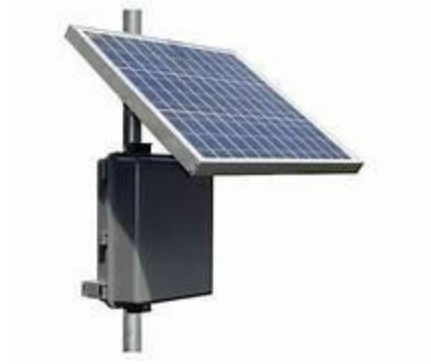
Fig.2.Solar panel with solar battery

The solar power system is harnessed with the help of the photovoltaic method which generally converts the energy from the sun which is solar radiation to electricity with the help of semiconductor material[6]. When solar radiation strikes the PV cell, then a lot of electrons are emitted. And when the emission of electron or streak of electron flows then there is a flow of electron. Then those electrons or electrical energy is stored in the battery which is connected to the load.