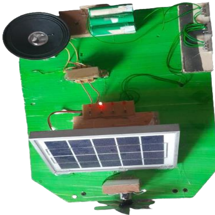
Fig.6.Future green car model