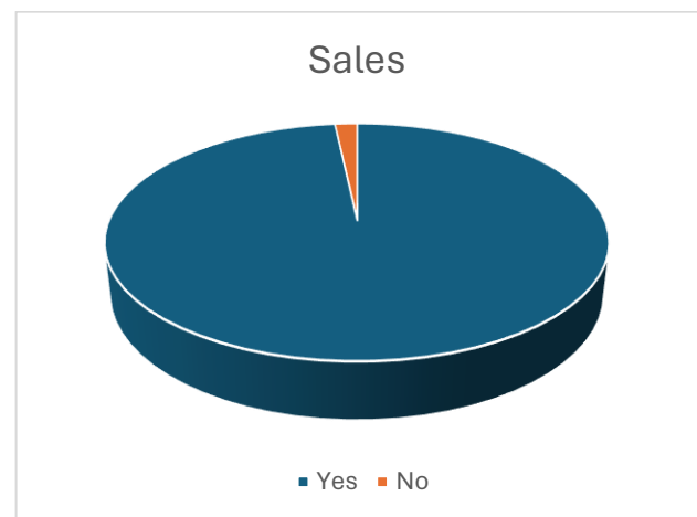
Figure 4.1 illustrates the awareness of Green Human Resource Management practices. It was revealed that only 98.3% of the respondents are familiar with GHRM.