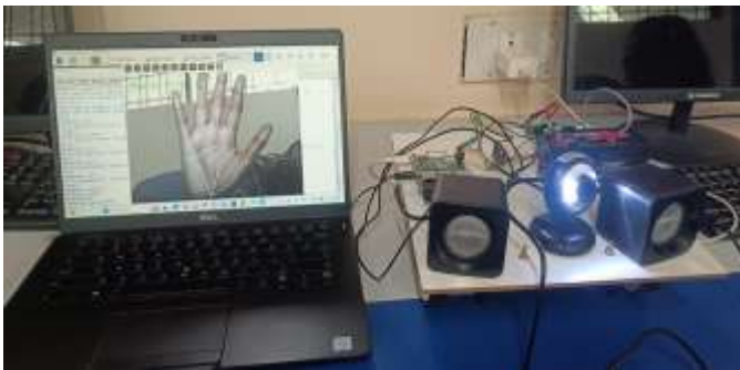
Fig 2: Hardware set up of proposed system

The hardware setup of the Hand Gesture Control Robo Car is centered around a Raspberry Pi, which acts as the main processing unit. A web camera is connected to the Raspberry Pi to capture real-time hand gestures from the user. The captured video is processed to recognize gestures and convert them into control commands. A motor driver module is interfaced with the Raspberry Pi to control the DC motors attached to the wheels, enabling movement of the robotic car in different directions.