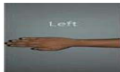
Fig.2 Gesture to move left

A) The Fig.2 specifically illustrates the gesture for moving left , which involves extending an arm horizontally with the palm facing downward. This gesture is interpreted by the system to command the car to turn left.