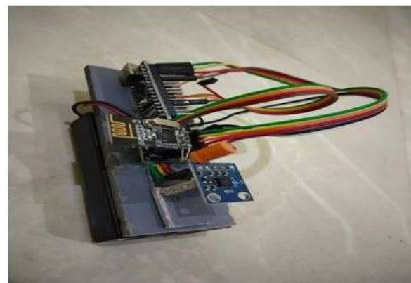
Fig.7 TRANSMITTER PART

Fig 7 shows the transmitter part. Transmitter part send the signal to the receiver part. The components include an MPU6050 accelerometer-gyroscope module, an NodeMCU microcontroller, and a motor driver, which work together to interpret hand movements and control the car accordingly.