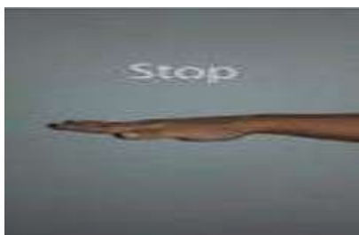
Fig.5 Gesture to move stop

D) The Fig.5 shows a hand gesture with the palm facing downward and fingers extended, labeled " Stop ," indicating a command for a hand gesture-controlled car to halt. The system detects this gesture to stop the vehicle immediately.