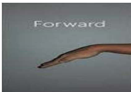
Fig.6 Gesture to move forward

E) The Fig.6 shows a hand gesture with the palm facing downward and fingers slightly curved, labeled " Forward ," indicating a command for a hand gesture-controlled car to move ahead. The system interprets this gesture to drive the vehicle forward.