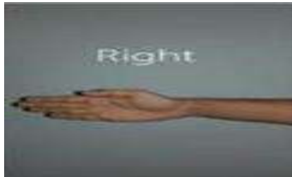
Fig.4 Gesture to move right

C) The Fig.4 shows a hand gesture with the palm facing left and fingers extended, labeled " Right ," indicating a command for a hand gesture-controlled car to turn right. The system recognizes this gesture to steer the vehicle in the desired direction.