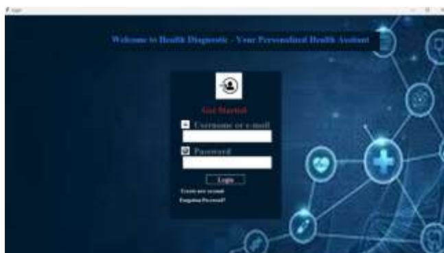
Fig.2. Login Interface

Step 1: This is the opening view of our application, which serves as the first step in user authentication. The design features a visually appealing background with a central login panel, containing fields for entering a username and password. Users can log in, register as a new user, or recover a forgotten password. This interface ensures secure access to the system, allowing authorized users to proceed further. If user is new it should create a new account otherwise user can login directly to the system [5].