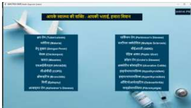
Fig.8. Other Diseases

Step 7: This interface shows the different more diseases to check their diseases The left column includes diseases such as Tuberculosis , Malaria , Dengue Fever , Chickenpox , Measles , HIV/AIDS , and Alzheimer's Disease . The right column lists conditions like Parkinson's Disease , Multiple Sclerosis , GERD , Crohn's Disease , and Hypothyroidism , among others. This organized layout helps users quickly identify, supporting health literacy and early awareness [1].