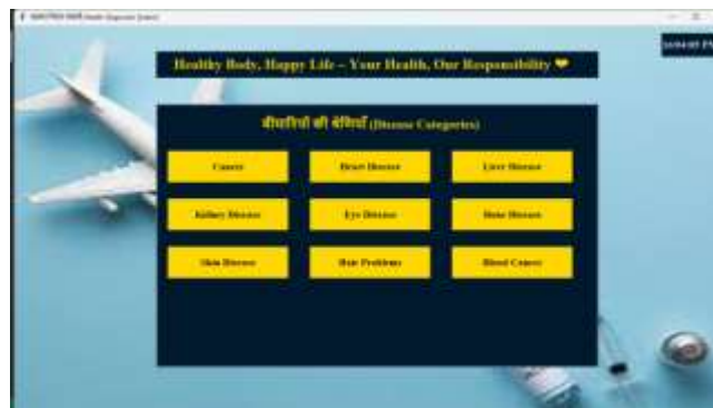
Fig.9. Disease Categories

Step 8: This interface also shows the different variety of diseases to predict the diseases as per their requirements. At the top message reads, " Healthy Body, Happy Life – Your Health, Our Responsibility ♥", reinforcing the system's commitment to user well-being. The layout features a grid of buttons, each labeled with a specific disease category such as Cancer , Heart Disease , Liver Disease , Kidney Disease , Eye Disease , Bone Disease , Skin Disease , Hair Problems , and Blood Cancer . These categories allow users to quickly access relevant information [8].