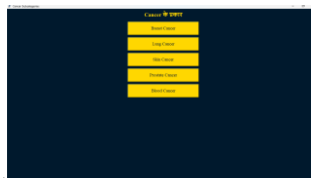
Fig.10. Cancer Types

Step 9: In this step it highlights subcategories under Cancer , allowing users to explore specific types of cancer for detailed insights. The layout includes five prominent buttons: Breast Cancer , Lung Cancer , Skin Cancer , Prostate Cancer , and Blood Cancer . The interface uses a dark blue background with bright yellow buttons for high visibility and ease of interaction. This organized design helps users navigate cancer-related health concerns with simplicity and focus [6].