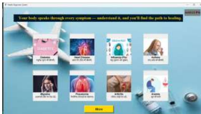
Fig.7. Symptom Diseases

Step 6: This step from displays the Symptom-Based Diseases module, helping users identify possible health conditions based on their symptoms. At the top, quote—"Your body speaks through every symptom — understand it, and you'll find the path to healing."—emphasizes the importance of early detection and awareness. The interface showcases a variety of common diseases. Conditions such as Diabetes , Heart Disease , Influenza , Asthma , Migraine , Pneumonia , Arthritis , and Anemia are featured. Each module can lead to the different diseases and can predict by their symptoms . There is one button "more" for more diseases to make the use of the models to predict the diseases [5].