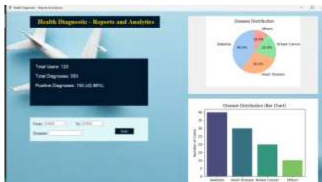
Fig.12.Reports & Analytics

diagnosis percentage. Users can filter data by date range and disease type. Visual insights are presented through a pie chart and bar chart , illustrating disease distribution across categories like Diabetes, Heart Disease, Breast Cancer, and Others [9].