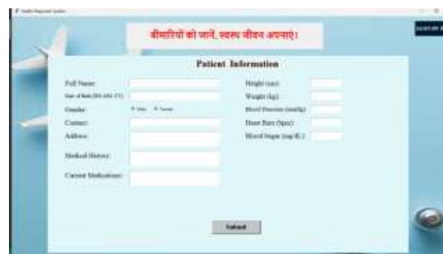
Fig.6. Patient Form

Step 5: This step is for patient information, designed to collect essential health-related data from users in a structured manner. This interface stores the patient data from the users to predict and analyze the diseases in accurate and in real time processing and It can store the information as a medical history [8].