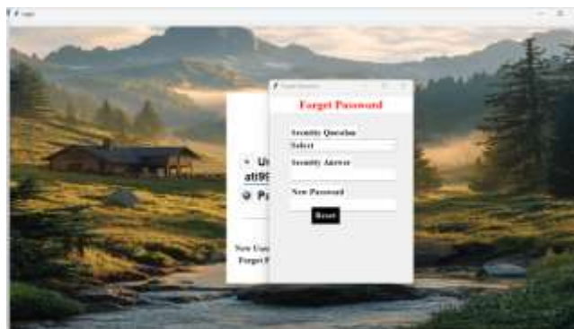
Fig.4. Forget Password Interface

Step 3: In this step the interface shows the option for forget password, in case any user forget its login credentials then it can generate new password by entering their security question with the correct answer, this way a user can generate a new password [6].