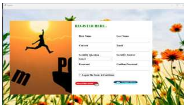
Fig.3. Signup Interface

Step 2: It is the second step of the project. This step allows users to login or new users to create an account by entering personal details such as first name, last name, contact, and email. It also includes security measures like select a security question and answer, setting a password, and confirm password for validation. Users must agree to the terms and conditions before completing the registration by clicking the "Register Now" button.[10].