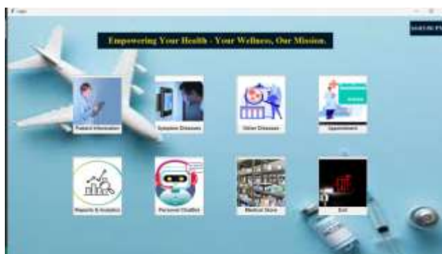
Fig.5. Dashboard Overview

Step 4: In this step a user find a dashboard interface from where it can access the services providing by the system. At the top, it features a motivational tagline—"Empowering Your Health - Your Wellness, Our Mission"—alongside a real-time digital clock for better time management. The main screen has eight modules: Patient Information for managing personal records, Symptom Diseases to identify illnesses based on user symptoms, Other Diseases for other categorical diseases, and Appointment for booking doctor consultations with their geographical location. Additional features include Reports & Analytics for visual health tracking, a Personal Chatbot to assist with health queries, a Medical Store for ordering medicines, and an Exit button to close the application. Each module is represented by icons over a professional background, ensuring functionality. Overall, the system provides an integrated solution for modern healthcare management in a digital format in a single platform [7].