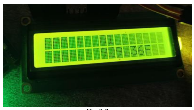
Fig 3.2 LCD Display