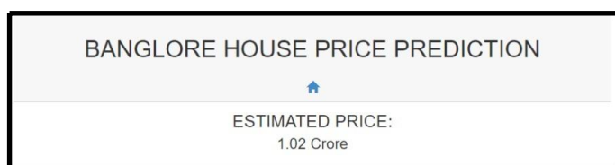
Figure 4: Predict