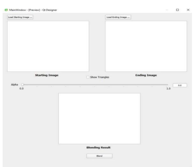
Fig 1. GUI