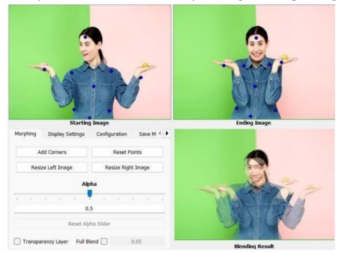
Fig 4. Output Image

Once you click on the blend button you will get the output image.