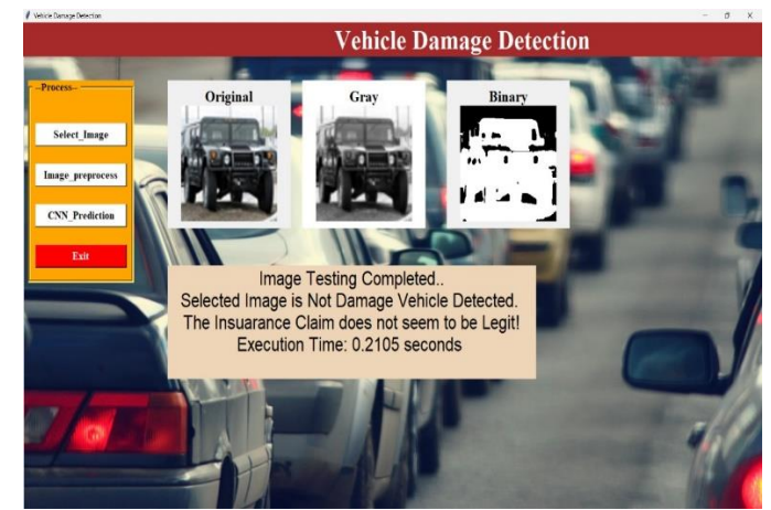
Figure 4.6: Result Page (Un-damaged Car)