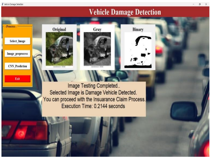
Figure 4.5: Result Page (Damaged Car)