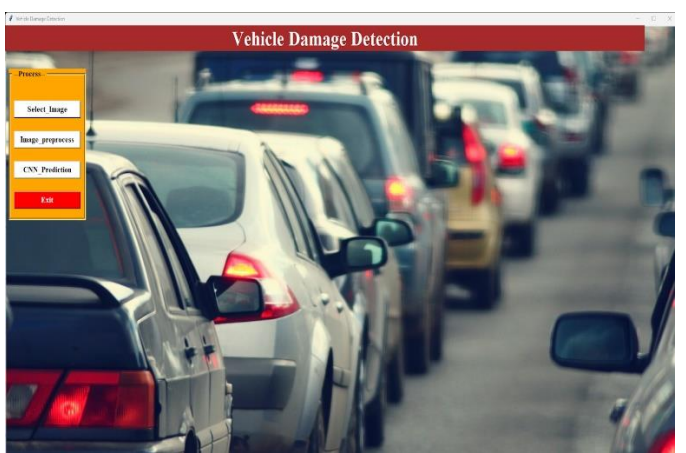
Figure 4.4: Home Page