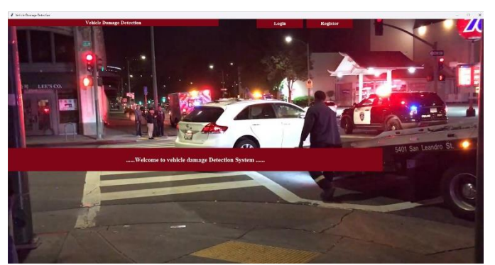
Figure 4.1: User Onboarding Page

The Snapshots of the Working Model are attached below for a clear understanding of the user-friendly GUI and the accessibility features: