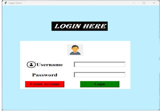
Figure 4.3: Login Page