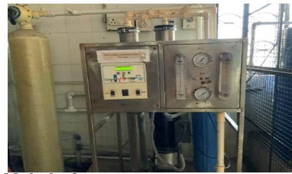
Methods of wastewater treatment

Pre-treatment process removes all materials (trash, tree limbs, leaves, branches, plastics and other large objects) that can be easily collected from the industrial effluents/wastewaters. Primary treatment of wastewater involves sedimentation of solid waste and this process is done after filtering out larger contaminants within the water. Approximately 25 to 50% of biological oxygen demand (BOD), 50 to 70% of TSS, 65% of the oil and grease are