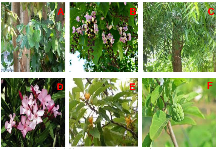
Fig.4. Plants that can sequester carbon [A. Peepal Tree ( Ficus religiosa ), B. Pongamia Tree ( Pongamia pinnata ), C. Neem Tree ( Azadirachta indica ), D. Nerium Plant ( Nerium oleander ), E. Champak Tree ( Michelia champaka ) and F. Anona Tree ( Anona squomosa )

Other suitable plant species can also be identified and planted as per the diversity richness of the place where the Institution is located. If more pollutants in the air are noticed, then necessary actions can be taken with the support of Government authorities to bring down the pollutants within the limits.