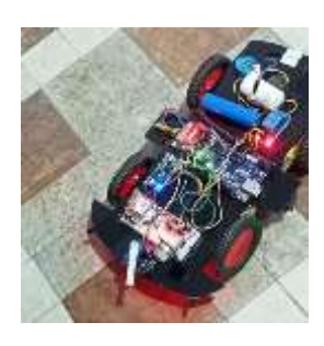
Fig: Prototype and the output

The Fire Extinguisher Robot was tested successfully and met its design objectives. It detects fire within a 10 cm range and covers a 180° field of view. The water spray system, with a 15–20 cm radius, effectively extinguishes fire when the robot aligns toward the source.