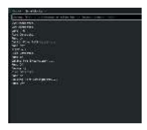
Fig: SMS and Call detection output

The Fire Extinguisher Robot was tested successfully and met its design objectives. It detects fire within a 10 cm range and covers a 180° field of view. The water spray system, with a 15–20 cm radius, effectively extinguishes fire when the robot aligns toward the source.