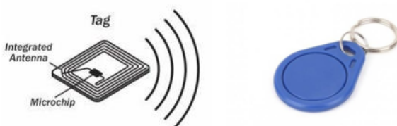
Fig -3.2: RFID Tags

RFID tags are used as tracking system which makes use of smart barcodes to spot items. RFIS stands for “radio frequency identification,” and as such, RFID tags utilize radio frequency technology. It is uniquely designed in HEX Code which makes it unique when it comes in terms of multiple layering in hardware embedded systems. It holds internal coil with in-built chip and integrated antenna and the unique HEX number in it. It is operated by transmitting and receiving information or data through antenna and a microchip.