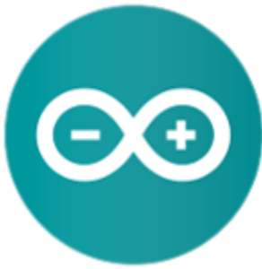
Fig -3.4: Arduino IDE

Arduino IDE is used for connecting the Arduino and Genuine hardware to upload programs and communicate with them. The basic working of Arduino is Arduino board is connected to a computer via USB where further it connects with Arduino IDE and the user writes the Arduino code in the IDE, and then uploads it to microcontroller which executes code, interacting with inputs and outputs such as sensors, cards, motors, RFID modules and lights. The same working is followed in smart basket. The Arduino board consists of microcontroller, and which relates to RFID reader, when product is scanned (the barcode) with RFID tag the working starts and the code execution begins.