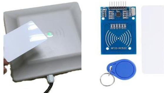
Fig -3.3: RFID Reader

RFID Reader is a transponding device which repels the sending of electromagnetic waves sent by the RFID tag when a product is scanned. It is the brain of the RFID system and is necessary for a system to function. They transmit and receive radio waves in order to communicate with RFID tags. Mobile readers are handheld devices that leave flexibility when reading RFID tags while still having the ability to speak with a number computer or smart device. There are two primary types of Mobile RFID readers; they are readers with an on-board computer which are called Mobile Computing Devices, and readers that make use of Bluetooth connection to a smart device which is called Sleds.