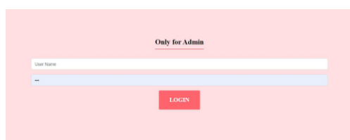
Fig 2. Log-in for NGOs