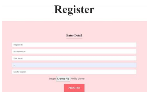
Fig 2. Registration for NGOs