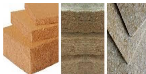
Natural fiber material

4.1.3. Natural fiber panels: Panels made from renewable natural fibers, such as hemp, jute, or coconut coir, are increasingly used for acoustic applications. These materials are sustainable, biodegradable, and offer excellent sound absorption properties.